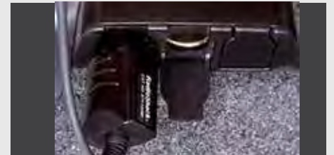
3-OUTLET 12V POWERBLOCK