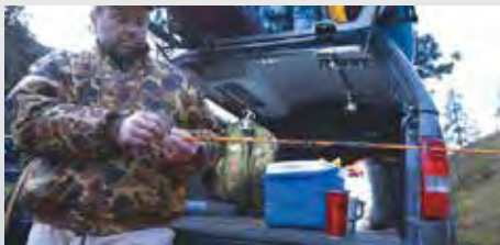
FISHING ROD HOLDER