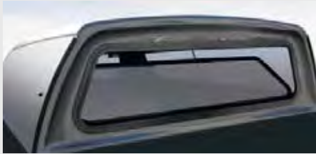
REMOVABLE FRONT WINDOW