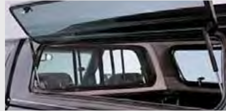
WINDOW FOR SIDE ACCESS