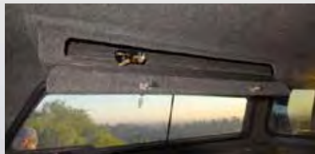
INTEGRATED STORAGE BIN