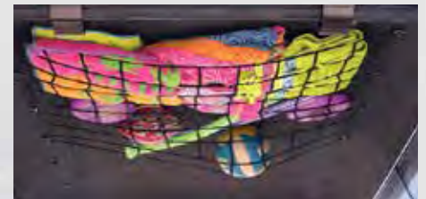
OVERHEAD GEAR NET