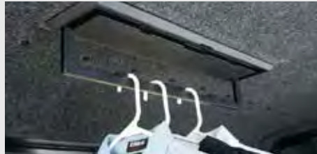
FOLDING CLOTHES HANGER