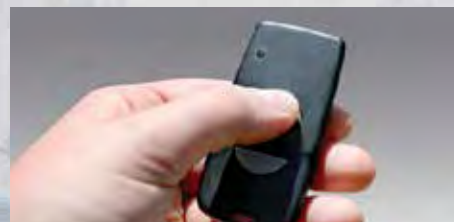
KEYLESS REMOTE SELECT MODELS