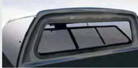
REMOVABLE SLIDER WINDOW